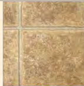
VR120 Montana Ridge