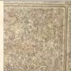
VR121 Montana Ridge