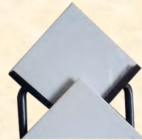
6" x 6" Walls in White or Almond