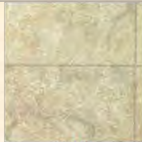
VR110 Port Villa