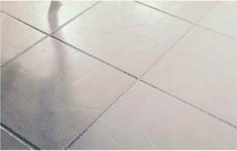
12" x 12" Floors in White or Almond