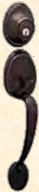
Exterior Foyer Entrance Door Handle and Lock