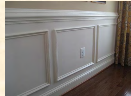
Base, Chair, & Shadow Box Molding