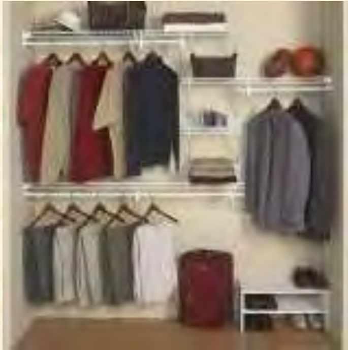
Closet Rod & Shelving

Photos Are For Illustrative Purposes Only. See Your Sales Representative For Details.