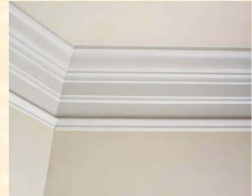
3 Piece Crown Molding