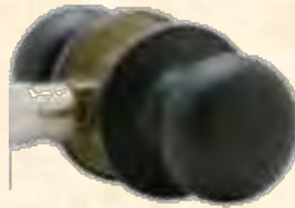
For All Interior and Exterior Doors Other Than The Exterior Foyer Entrance