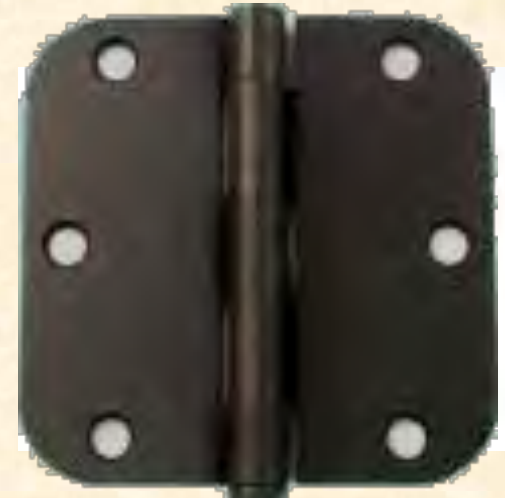
"Black" Color Hinges